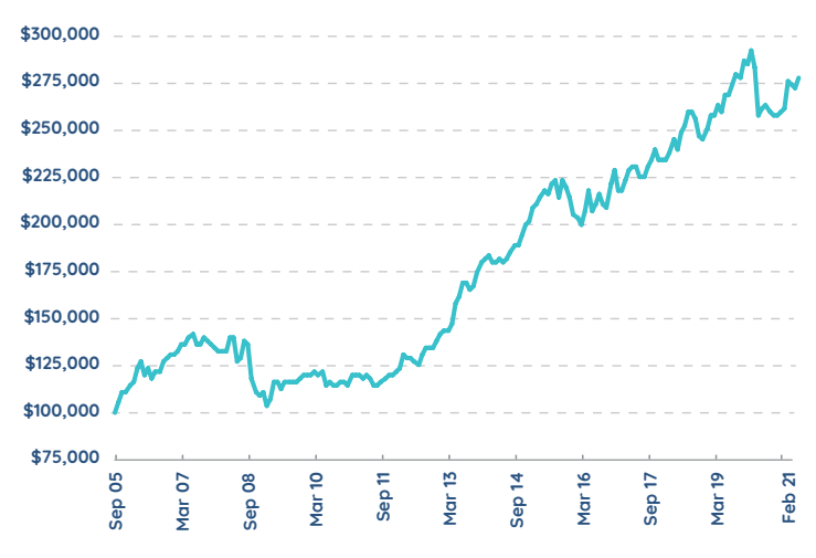
6 Calculations are based on exit price, net of management fees and expenses and assume reinvestment of distributions Past performance is not a reliable indicator of future performance