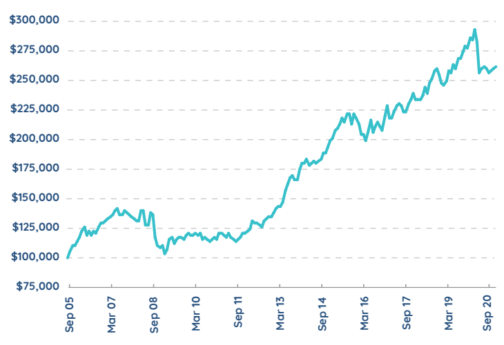
6 Calculations are based on exit price, net of management fees and expenses and assume reinvestment of distributions Past performance is not a reliable indicator of future performance