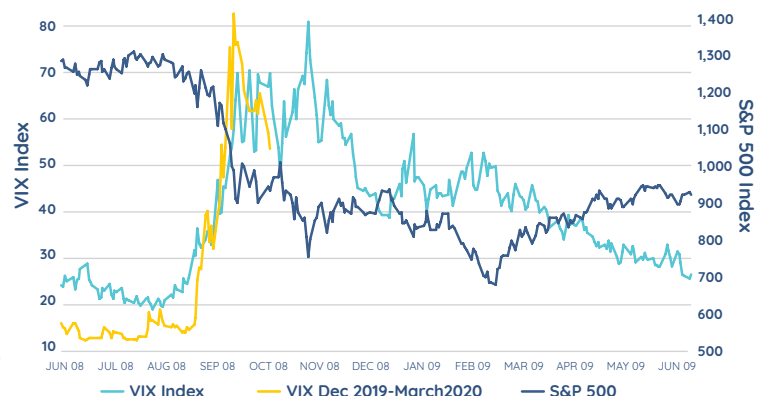
Exhibit 1: Volatility now vs. the GFC

It is no coincidence that March 2020 was in line with this level.